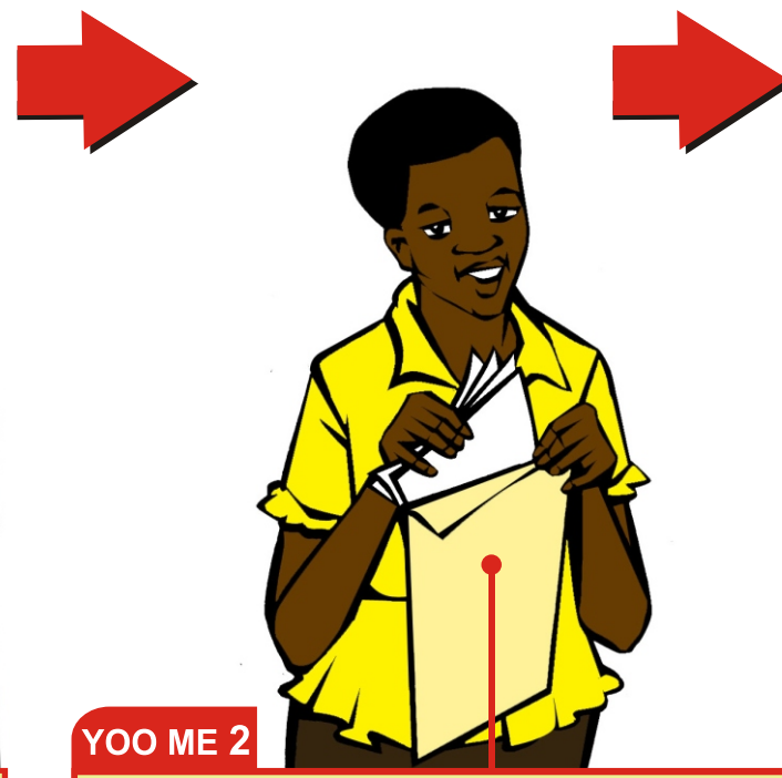
YOO ME 2