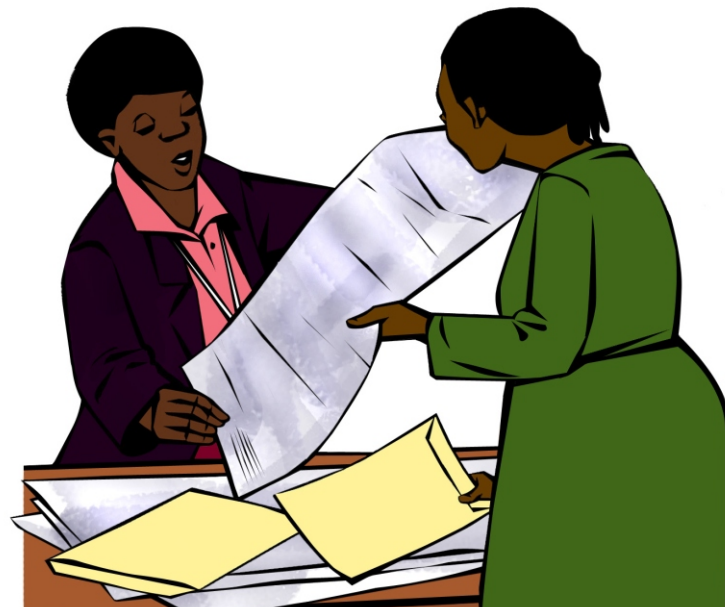
YOO ME 5 JANG GANG KAL NGOM

Ripot me Pimo Ngom ki menyo ki nyonyo pa munu ka kicwalo bot Latic Pimo Ngom, me cwalo pi medone bot Latic ikom Cal Ngom ducu, ka dok kidwoko bot Latic Poko Tic Ngom. Ka kiyer ni rwatte, ci kicwalo bot Latic ma moko wel ngom. Cul pi karatac me acel ki me ngino ngom time ka kirudu karatac me acel.