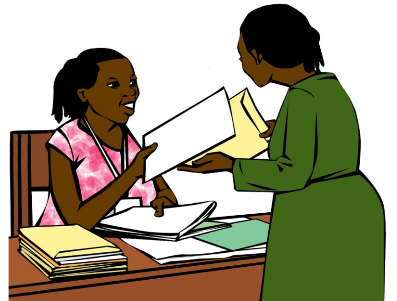
YOO ME 4 JANG GANG KAL NGOM

Ripot me Pimo Ngom ki menyo ki nyonyo pa munu ka kicwalo bot Latic Pimo Ngom, me cwalo pi medone bot Latic ikom Cal Ngom ducu, ka dok kidwoko bot Latic Poko Tic Ngom. Ka kiyer ni rwatte, ci kicwalo bot Latic ma moko wel ngom. Cul pi karatac me acel ki me ngino ngom time ka kirudu karatac me acel.