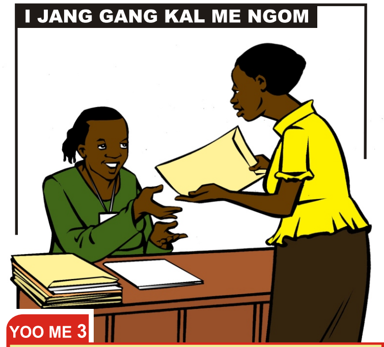
YOO ME 3