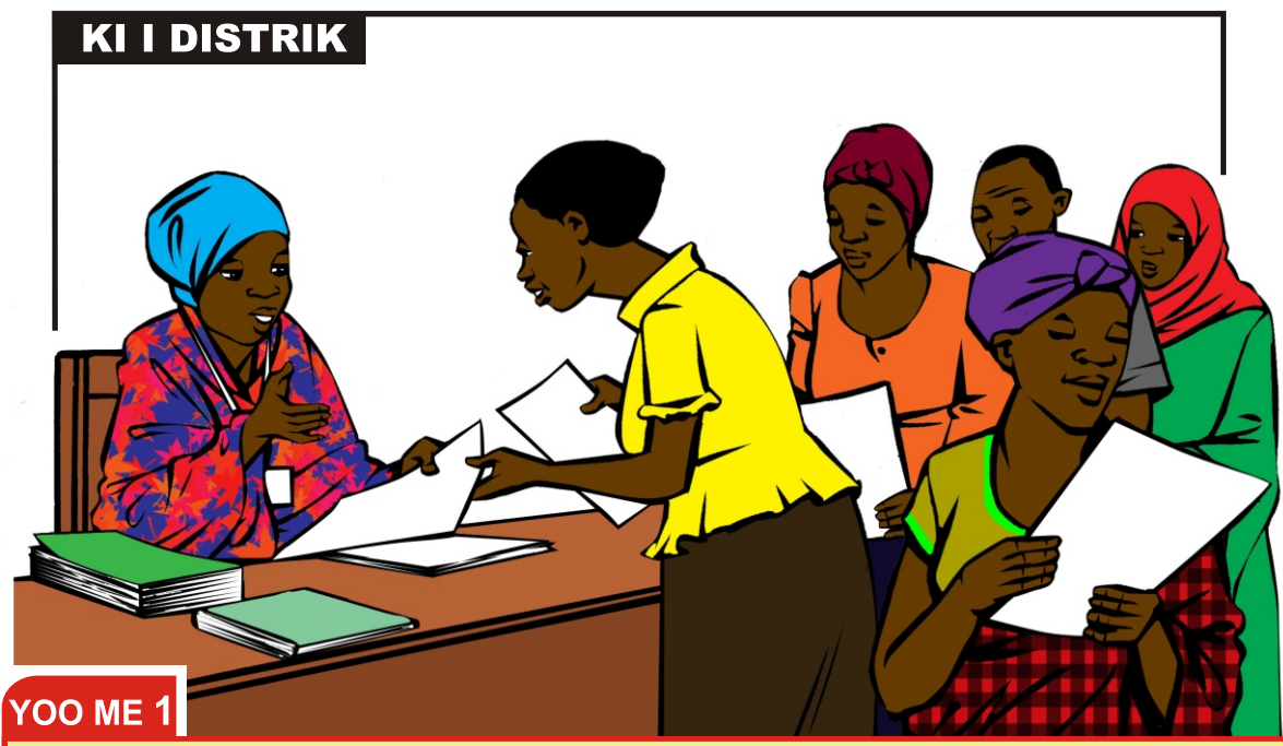
YOO ME 1