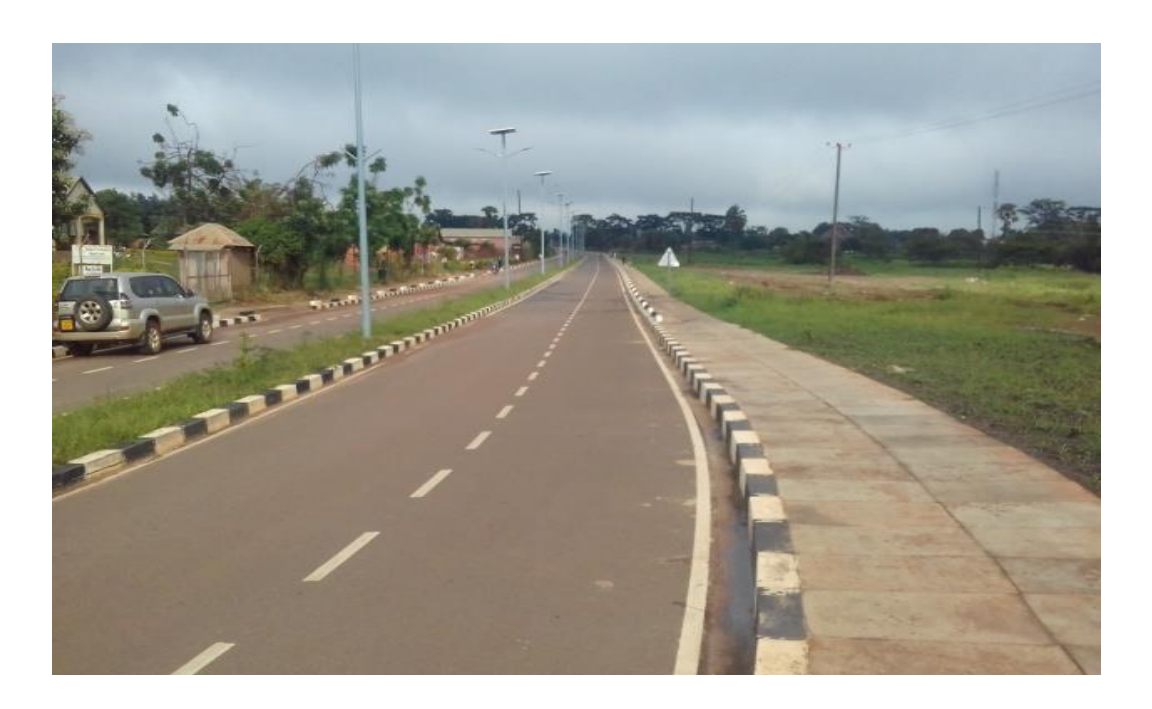
Commercial Road under USMID in Gulu (After)

Lights and road markings have been installed to enhance safety on the road especially at night.