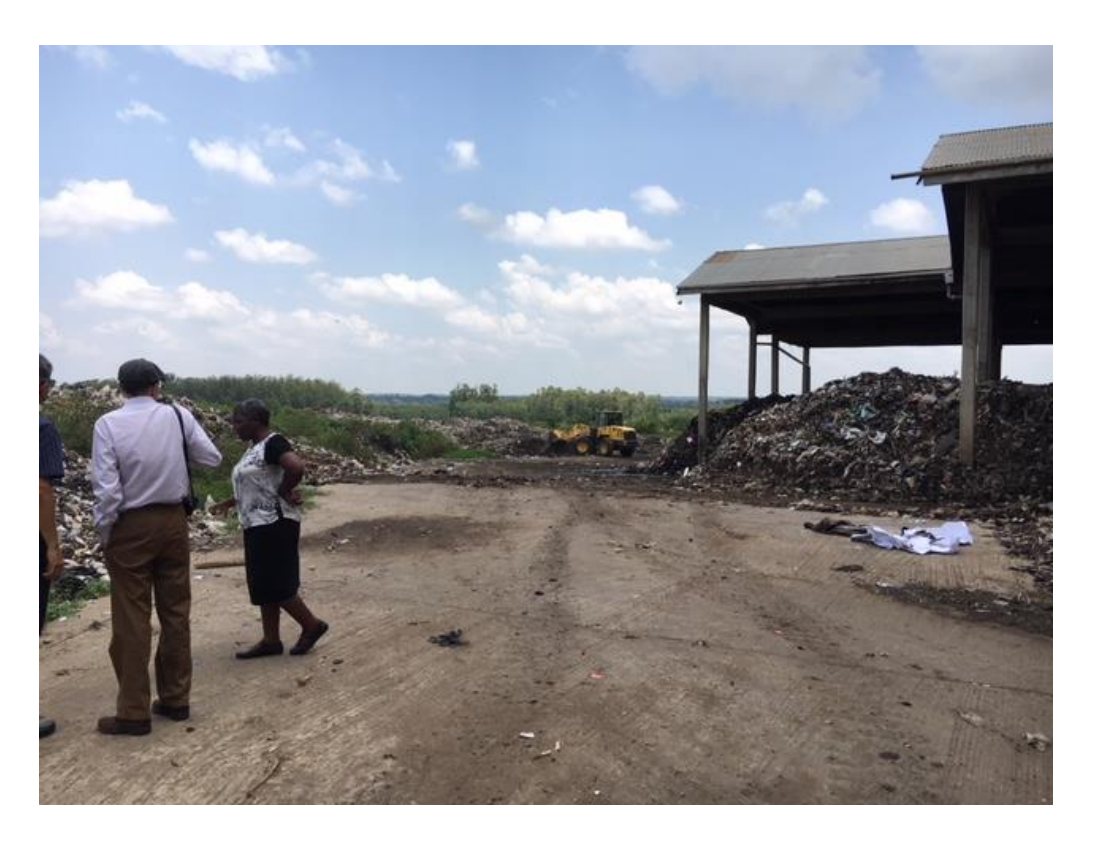
Solid waste dump and compost site in Mbale