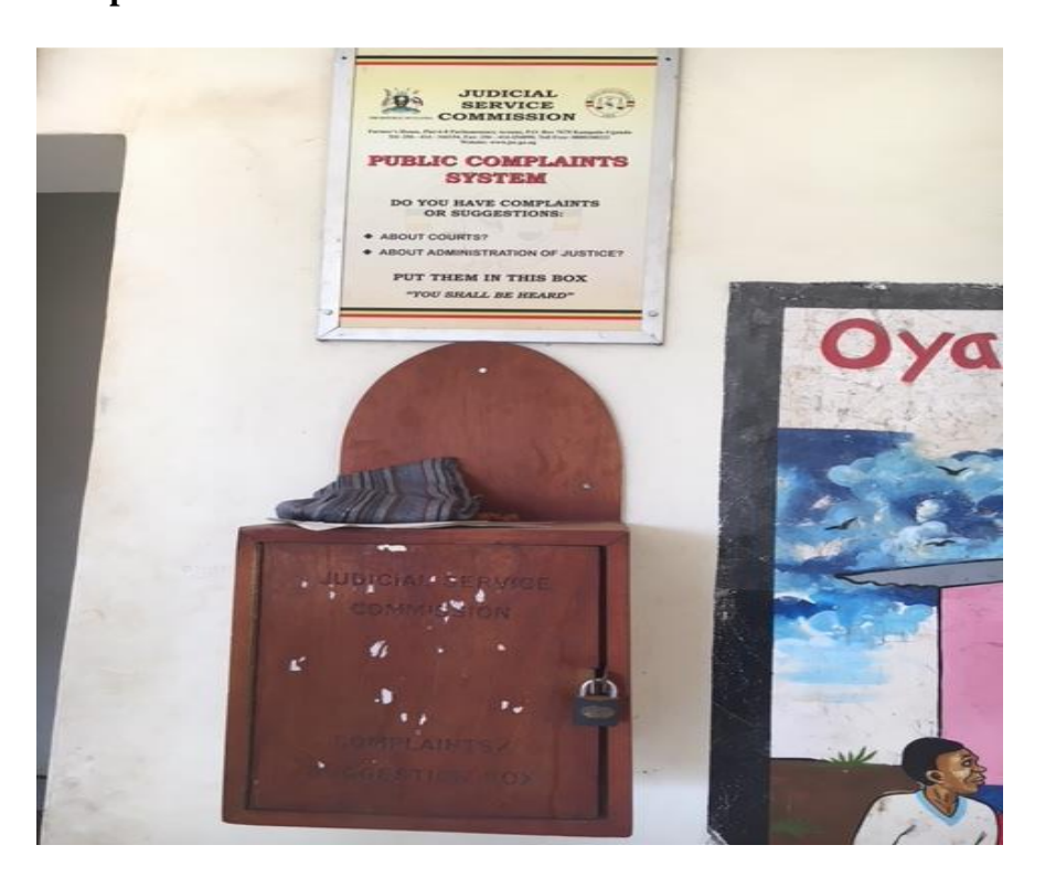
Complaints registry box in Kamuli Municipal Office