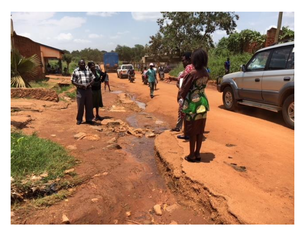
Lack of drainage system and road erosion in Kitgum