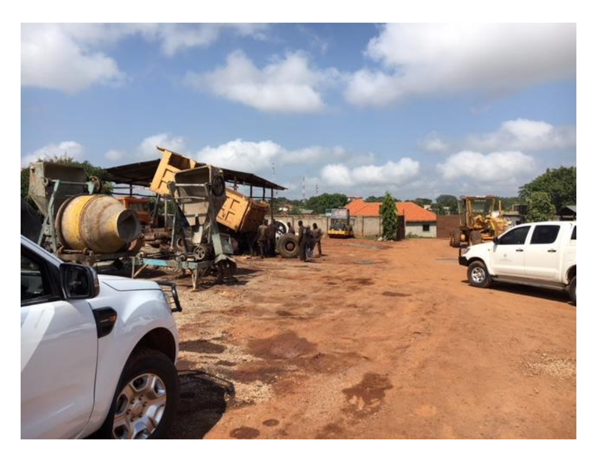
Camp site in Lira