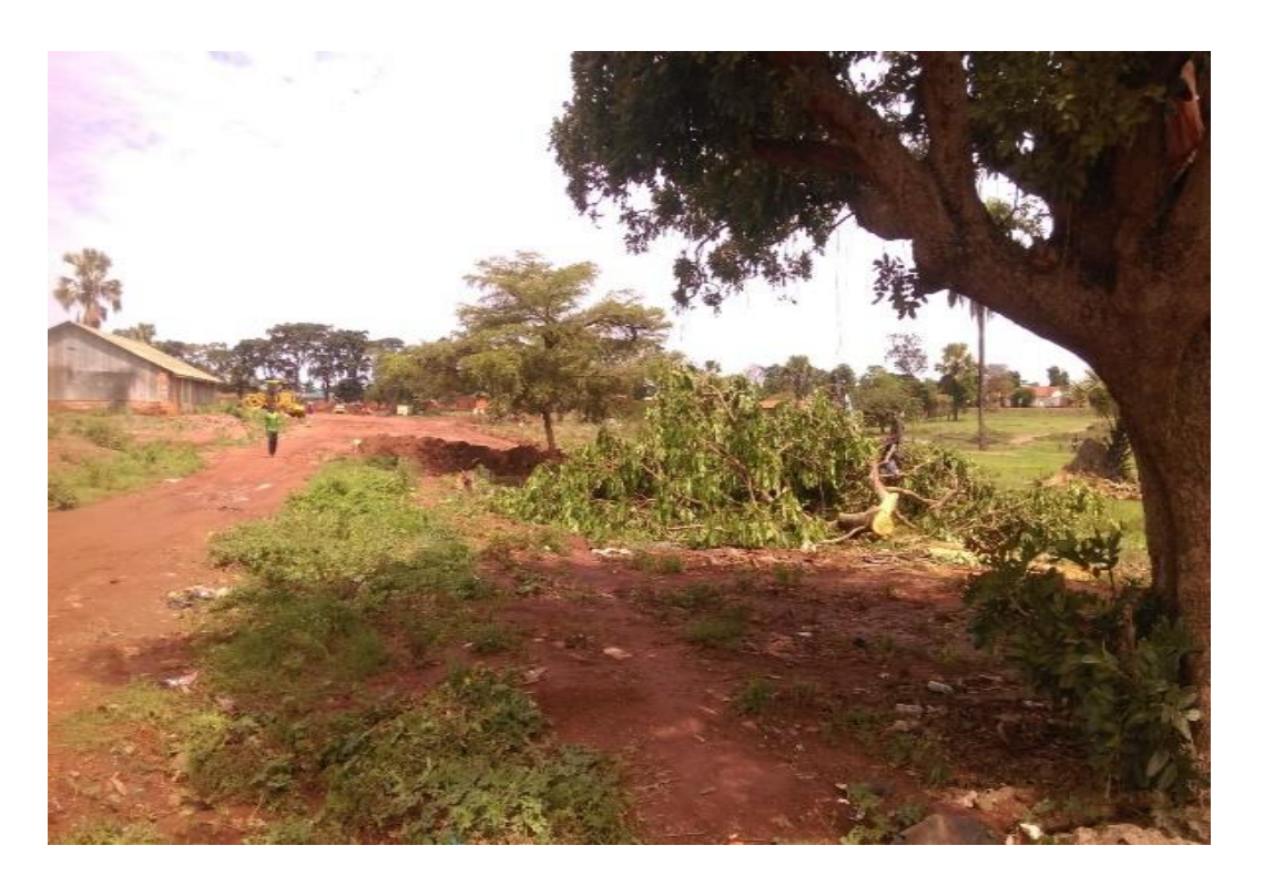
Commercial Road under USMID in Gulu (Before)