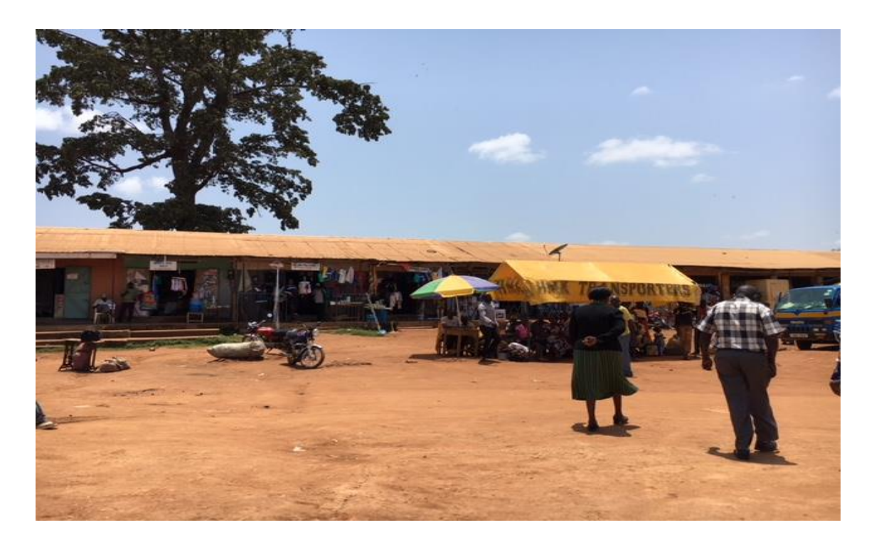
Bus/taxi park in Kitgum