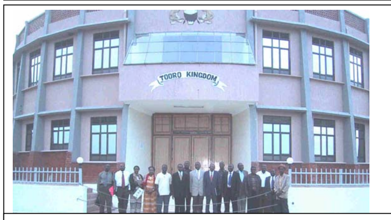
The Kingdom of Toro Palace for H.H. King Rukira Bashaija Oyo Nyimba Kabamba Iguru Rukidi; rebuilt after 1994.