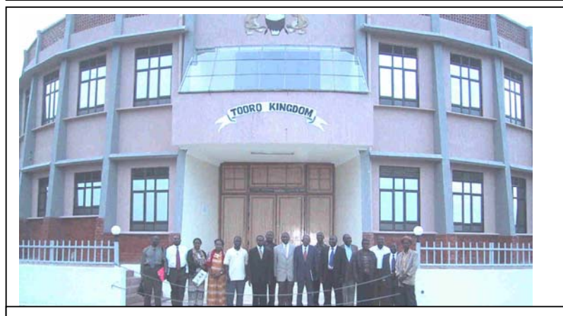
The Kingdom of Toro Palace for H.H. King Rukira Bashaija Oyo Nyimba Kabamba Iguru Rukidi; rebuilt after 1994.