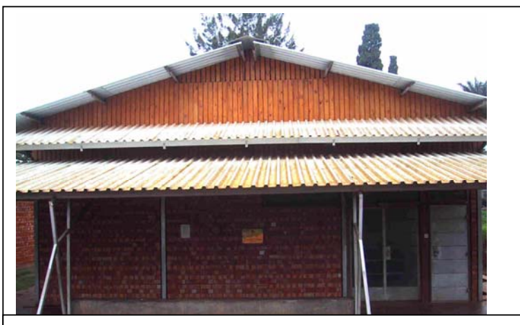
Earthquake resistant building in Virika Hospital, Fort Portal, rebuilt after 1994 earthquake; notice the timber at the gable end of the wall.