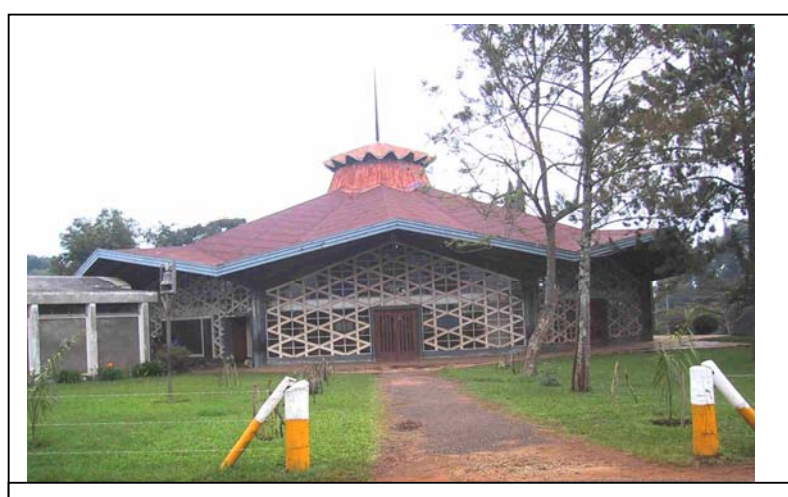
The Catholic Cathedral at Fort Portal rebuilt after the 1966 earthquake to earthquake resistant standards