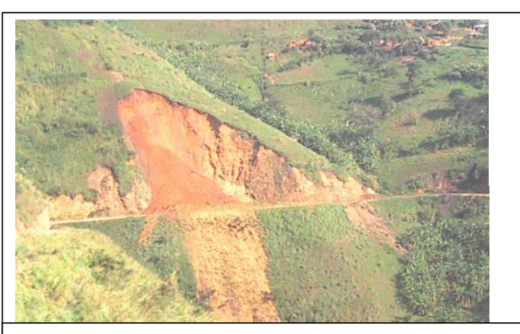
Landslides are very common in the Rwenzori Zone