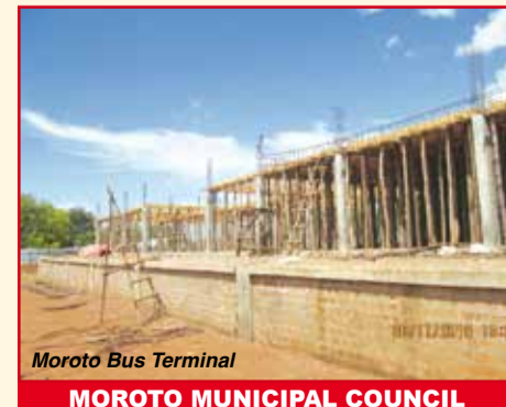
Moroto Bus Terminal