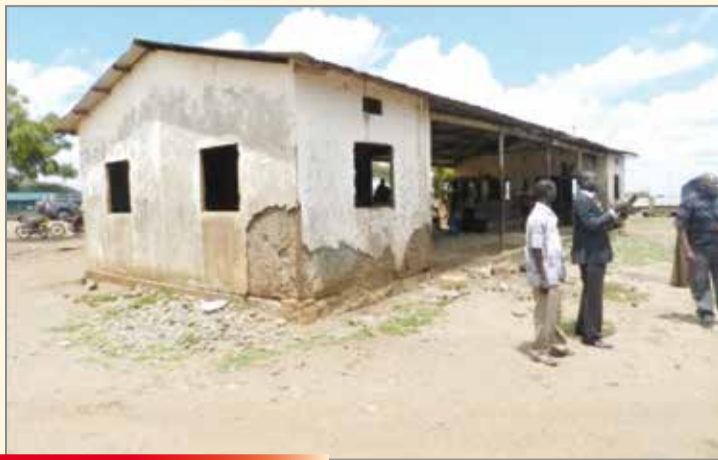
← Moroto Bus Park Building before USMID Program