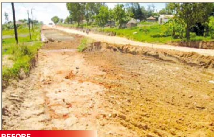
← Enyau Road in Arua at before USMID Program