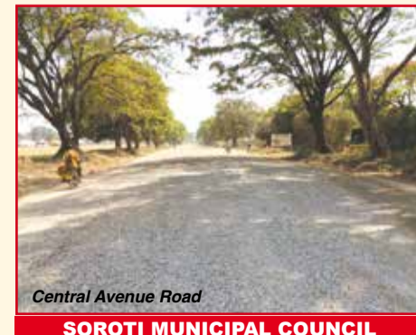
Central Avenue Road