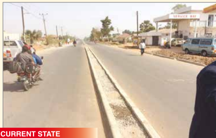
← Enyau Road after USMID Program