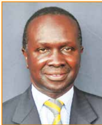
HON DAUDI MIGEREKO Minister