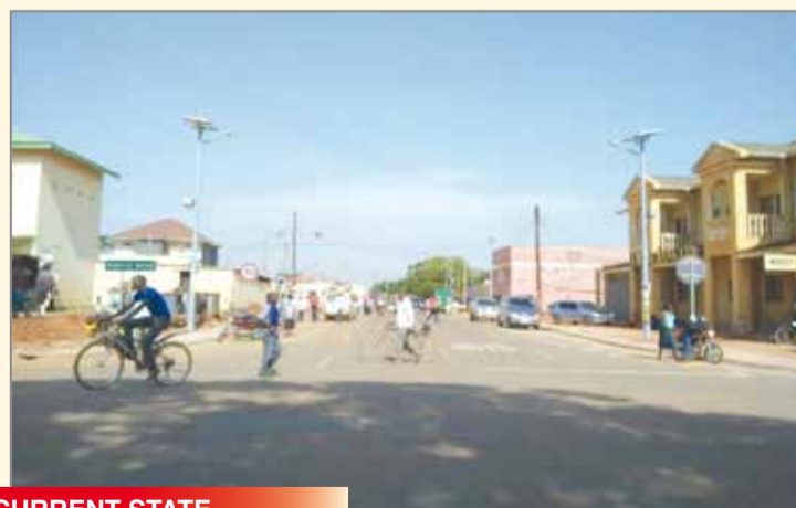
← Maruzi Road in Lira, after USMID Program