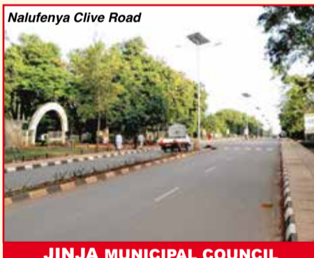
Nalufenya Clive Road