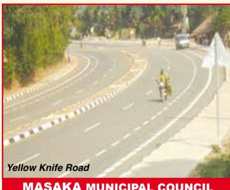
Yellow Knife Road