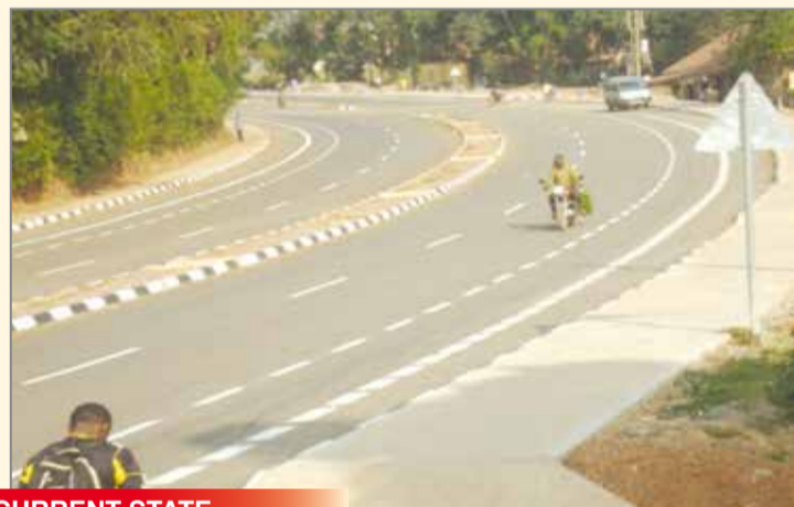
← Yellow Knife Road, after USMID Program