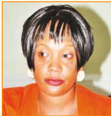
HON. ROSEMARY NAJEMBA State Minister for Urban Development