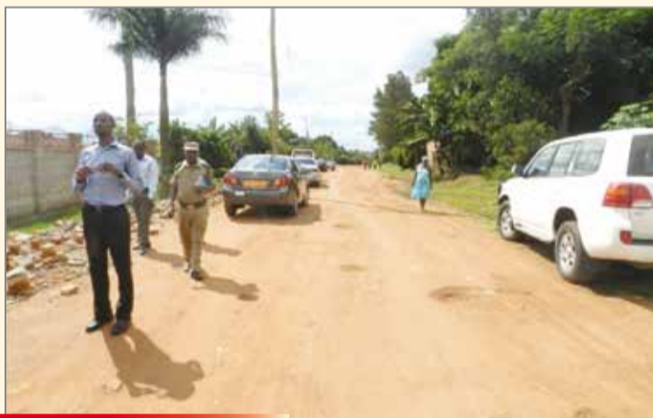
← Yellow Knife Road, Masaka before USMID Program