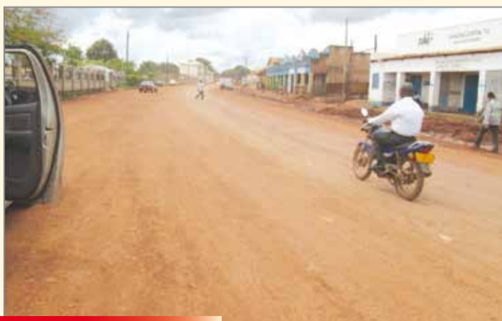
← Maruzi Road in Lira, before USMID Program