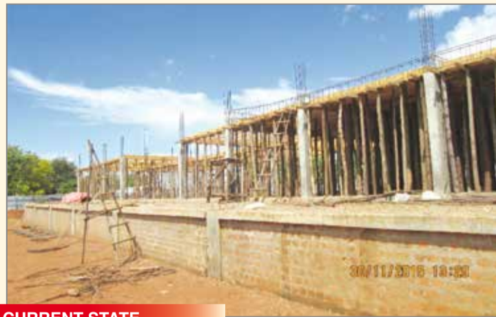
← Moroto Bus terminal under USMID Program (to be completed in the next few months)