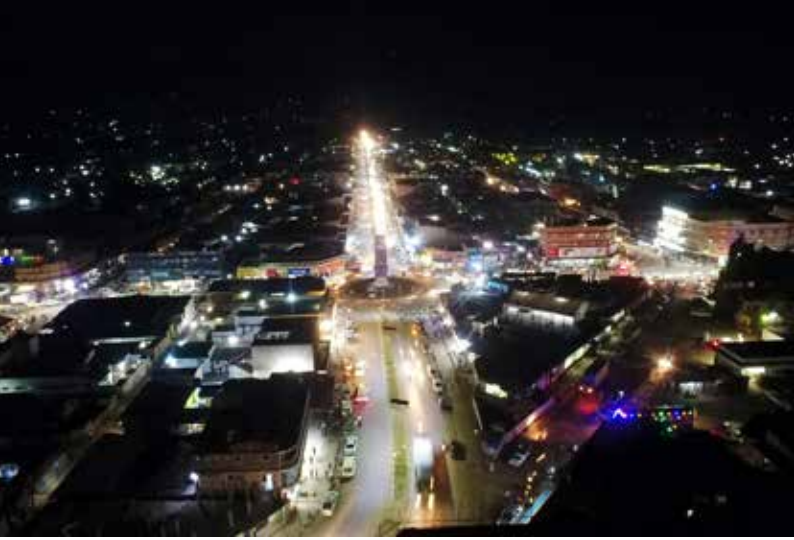
Night view of Clock Tower Roundabout