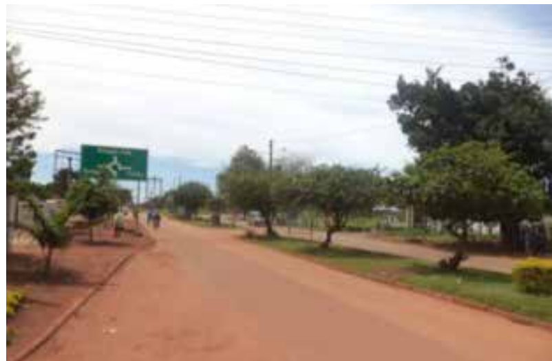
Nalufenya Road in Jinja, before and after redevelopment by USMID