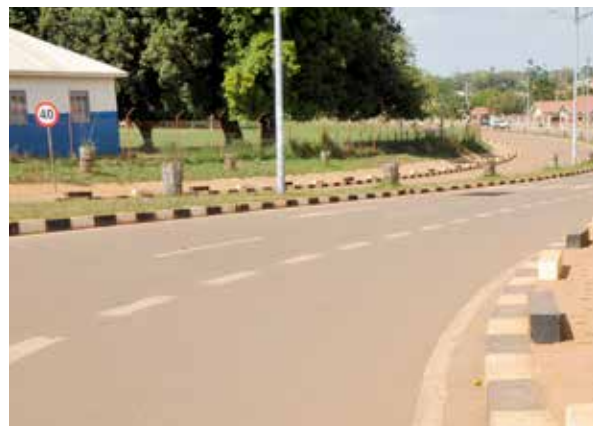
Oyam Road furnished with a pedestrian walkway