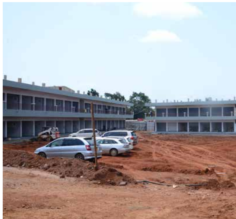
Entebbe Kitoro taxi park