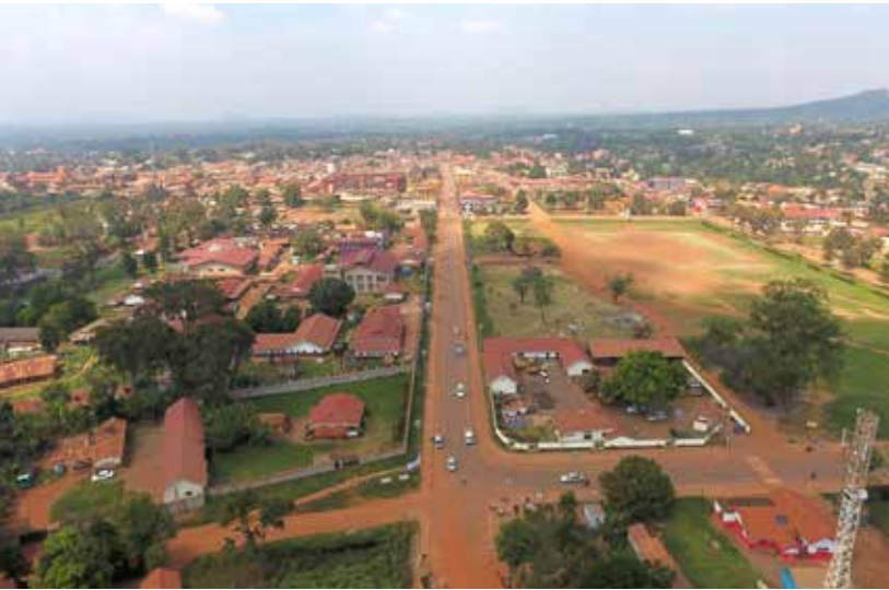
Old Tooro Road