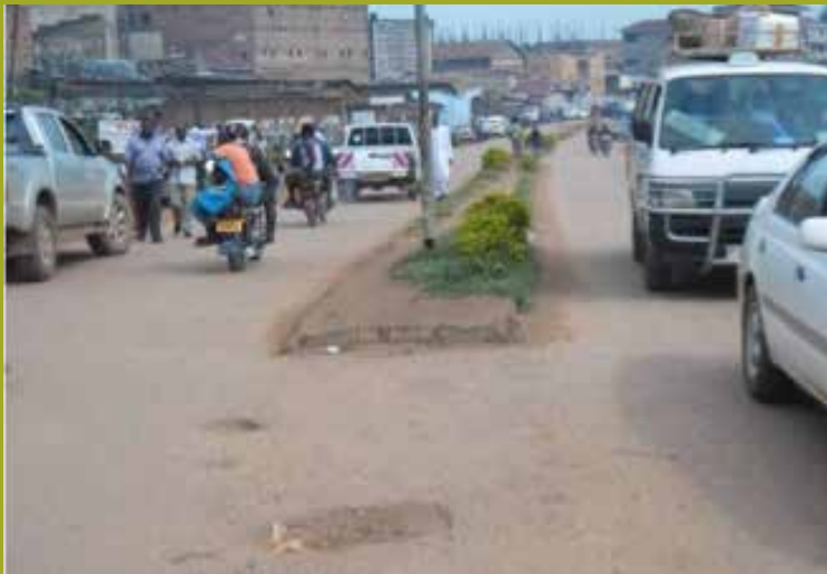
Akiiki Nyabogo Road, Mbarara, before redevelopment