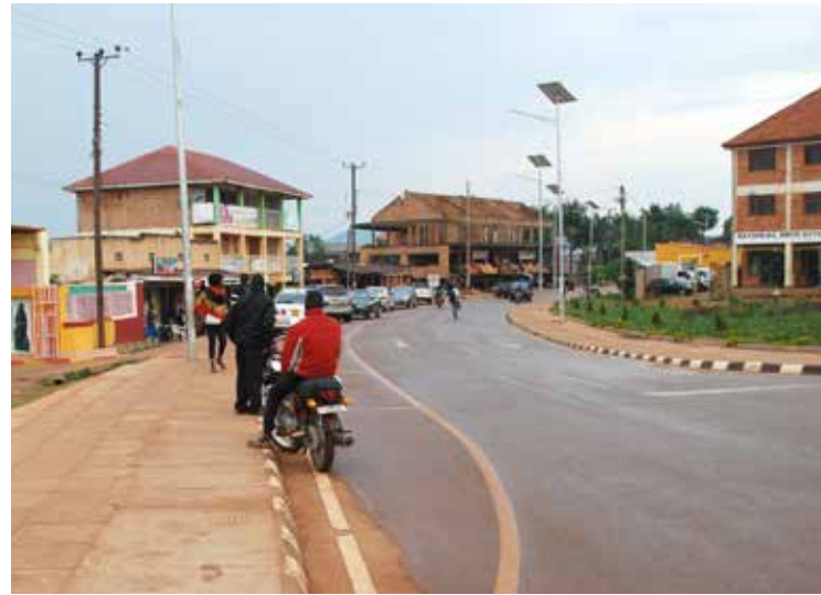
Old Tooro Road