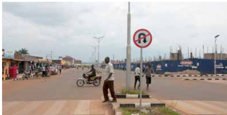
Above: A zebra crossing on market street Left: Oguti II Road in Tororo Municipality