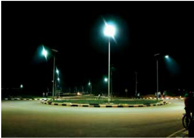
The roundabout connecting Sir Samuel Baker Road and Ring Road is well-lit, which has improved safety in the municipality