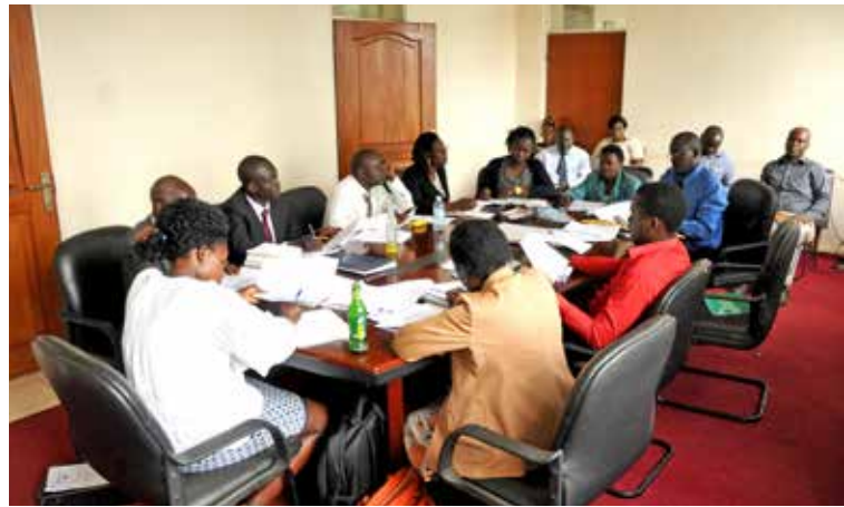
Tororo Municipal Council members in a meeting in the Mayor's Palour, which was also furnished using USMID funds