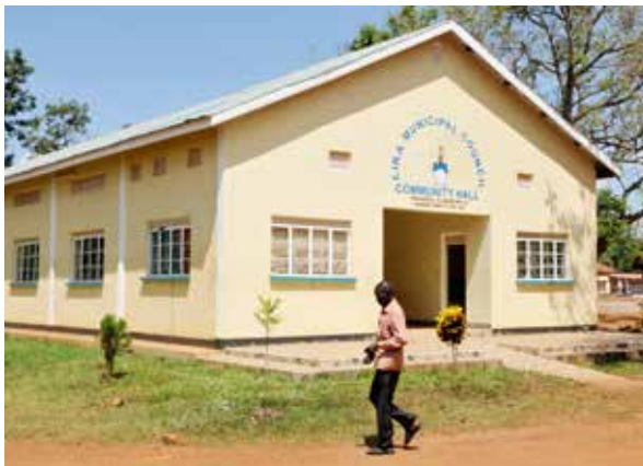
The renovated Lira Community Hall