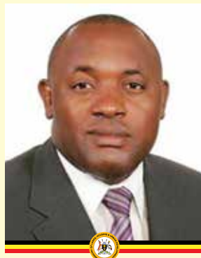
Hon. Dr. Chris Baryomunsi, Minister of State for Housing