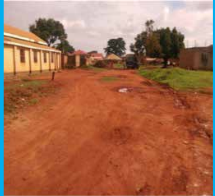
Crane Avenue in Gulu Municipality before and after USMID intervention

Gulu is located in northern Uganda and was the epicenter of the Lords Resistance Army insurgency. It is a booming town with now well marked roads. Property rates have significantly gone up since USMID funded the infrastructure in the town. “Plots here are going for Shs200m. It is a very big increase from less than Shs50 million before the commencement of the USMID program. The roads have also opened up business opportunities in areas where they didn’t exist a while ago,” says David Labeja, a businessman in Gulu. “I hope that Gulu can now become a city instead of being a municipality because we now have the infrastructure needed for the city. I would love them to construct more roads,” says Mary Lakor, a kiosk owner in town.