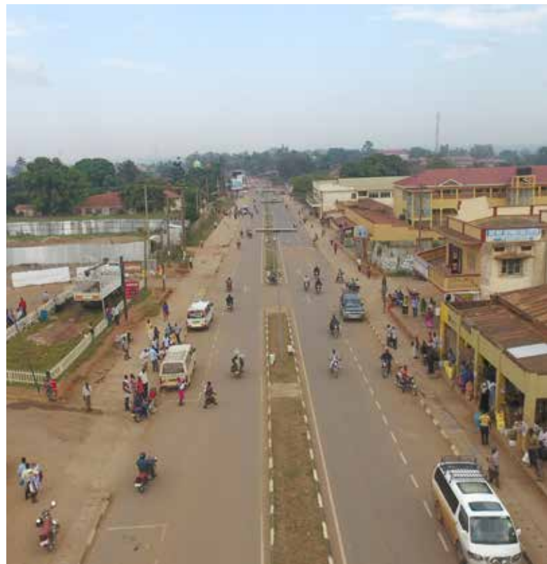
Above: Pallisa Road Left: Republic Street