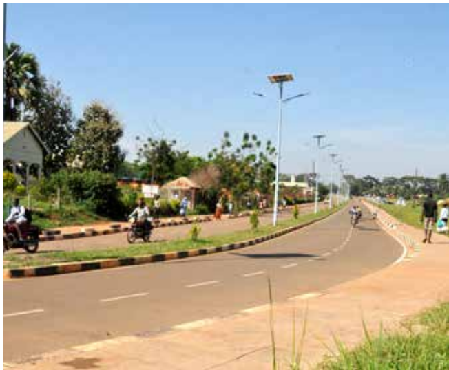
A pedestrian on a walkway along Dr. Onkolit Road