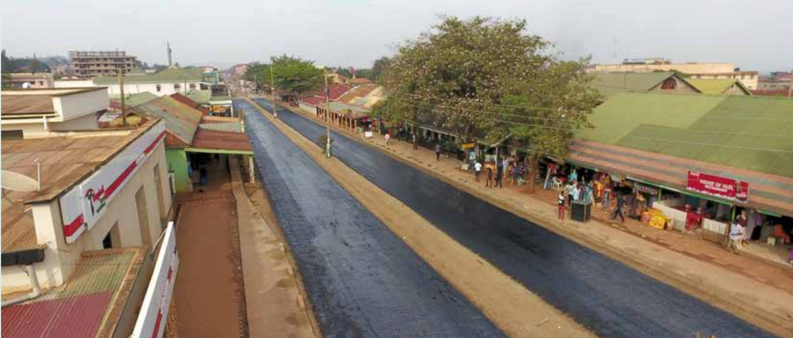
Main Street under construction