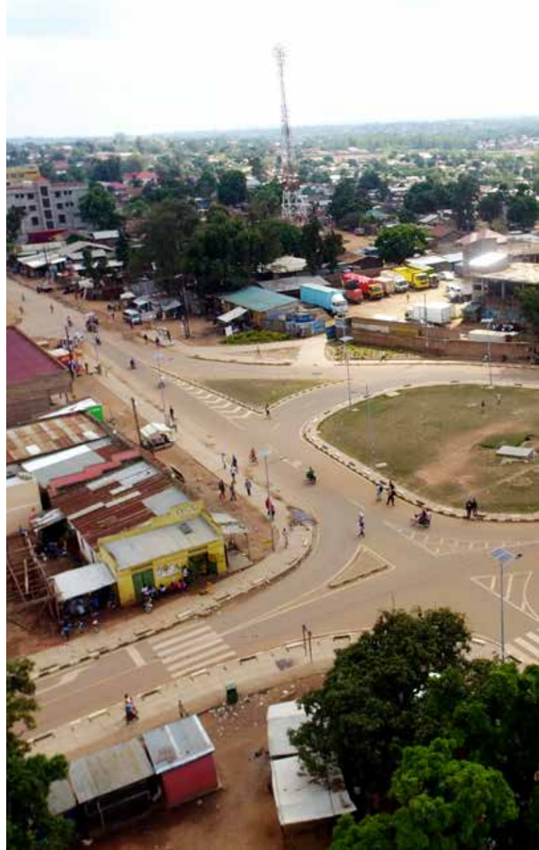
Lemerijoa Roundabout in Arua Municipality