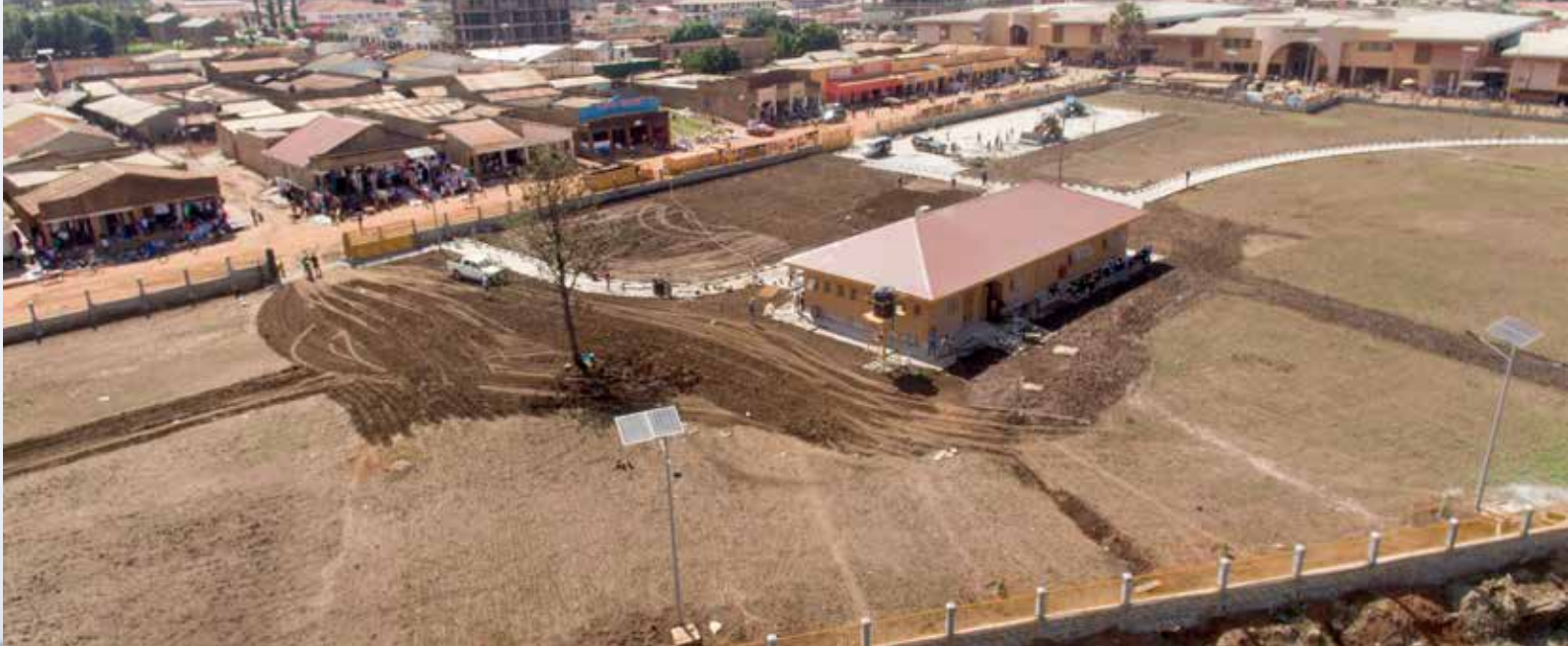
Lira Coronation Park under construction