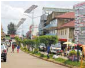
18 Fort Portal