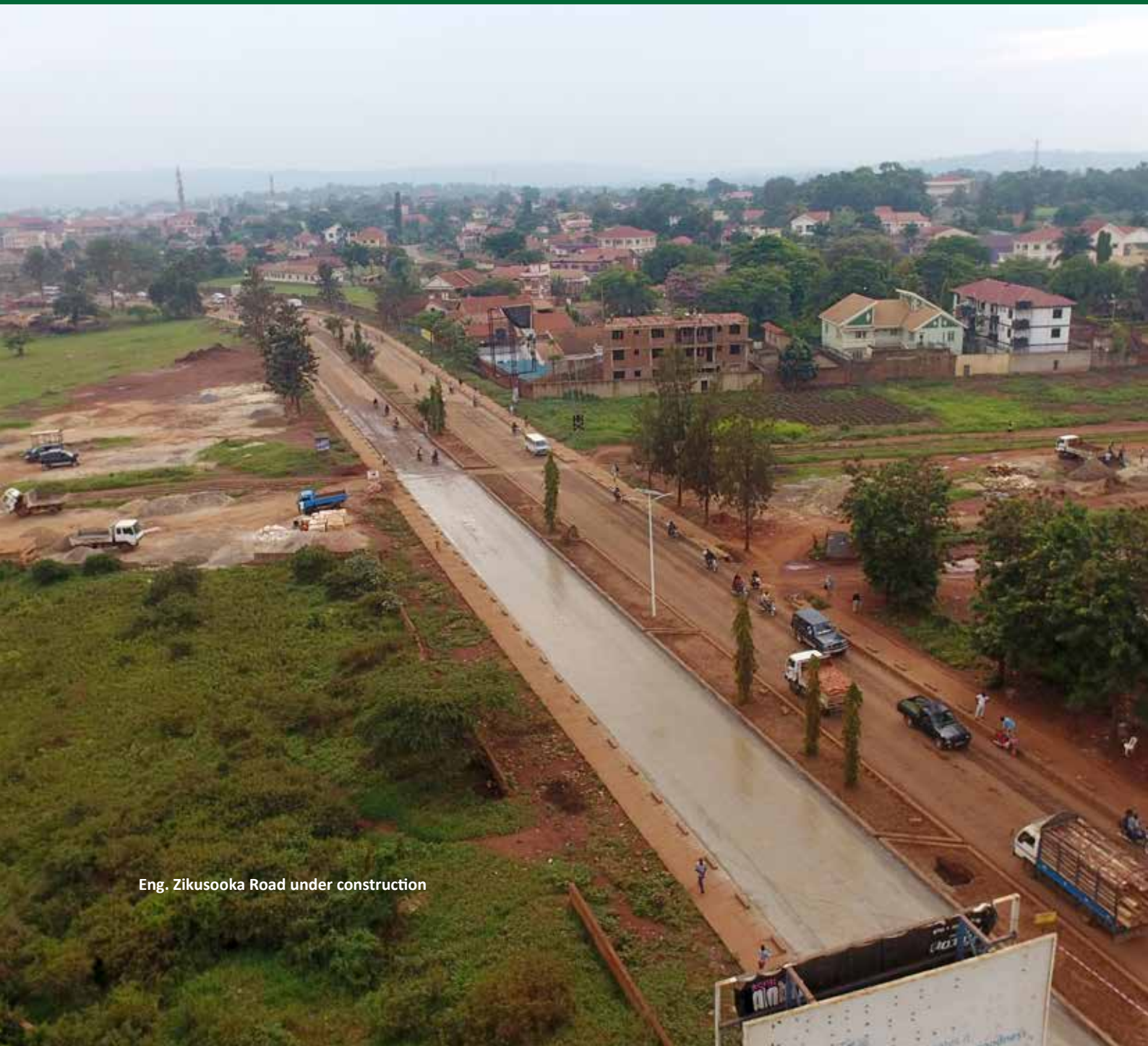
Eng. Zikusooka Road under construction