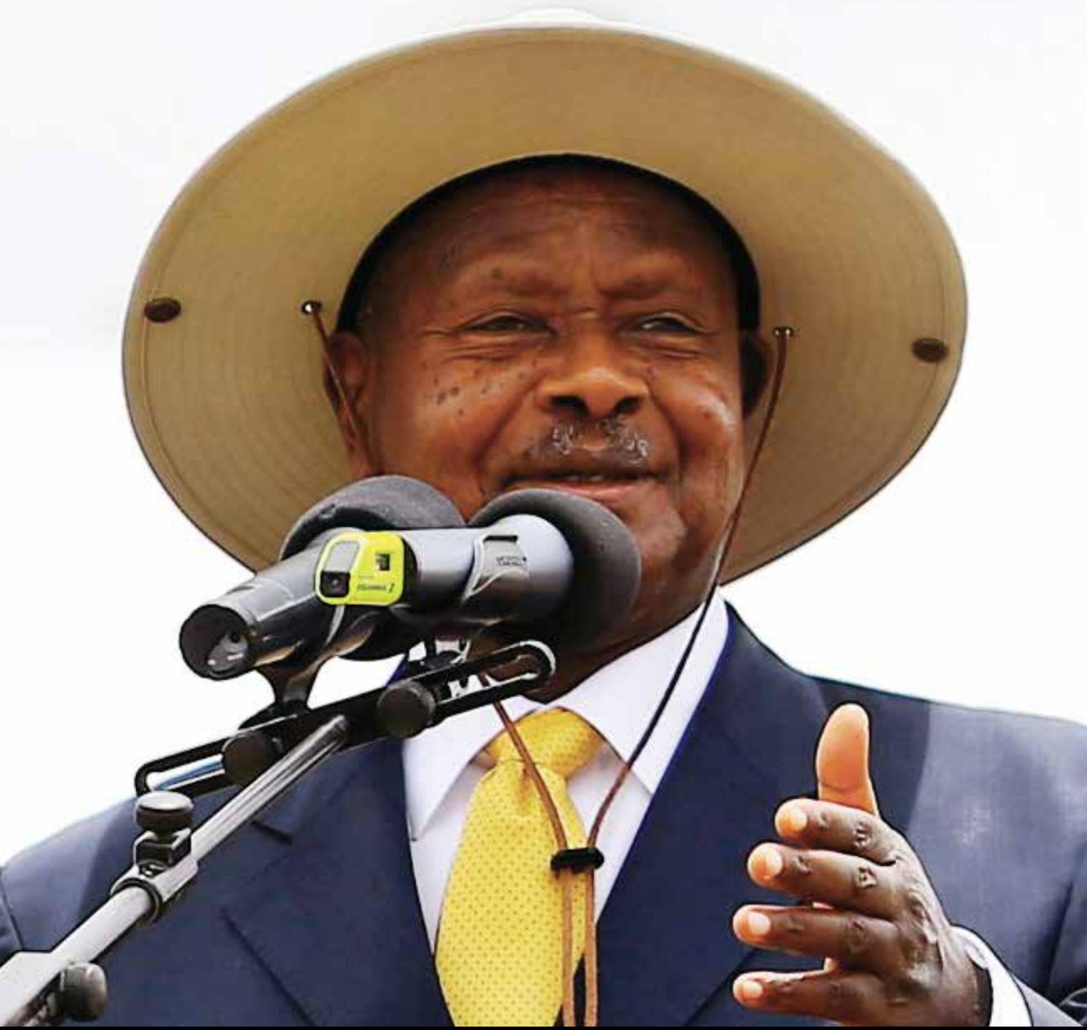
H.E. Yoweri Kaguta Museveni, President of the Republic of Uganda