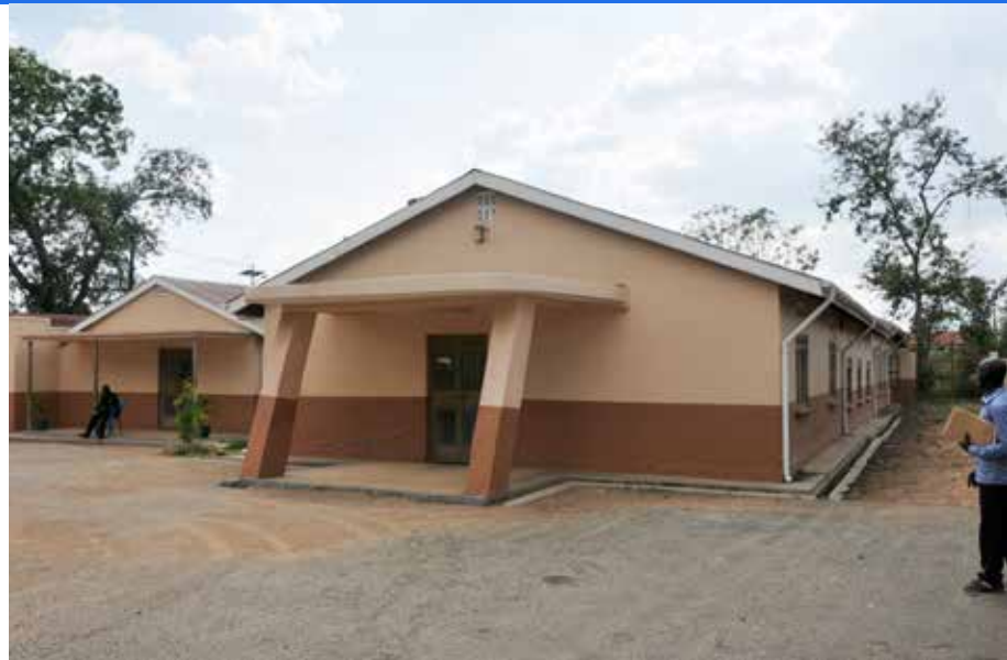
Arua Municipality renovated offices by USMID