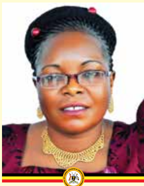
Hon. Persis Namuganza, Minister of State for Lands