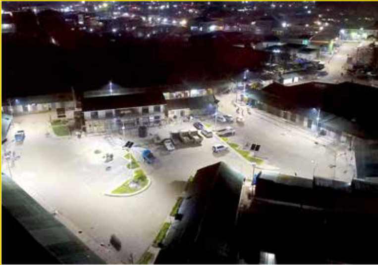
The paved, solar-lit Fort Portal lorry taxi park and lock-up shops