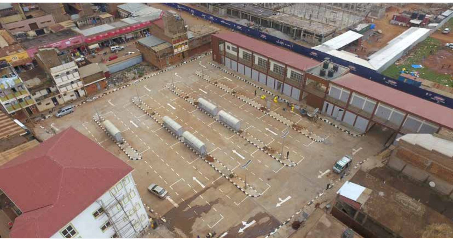
Aerial view of Tororo Taxi Park