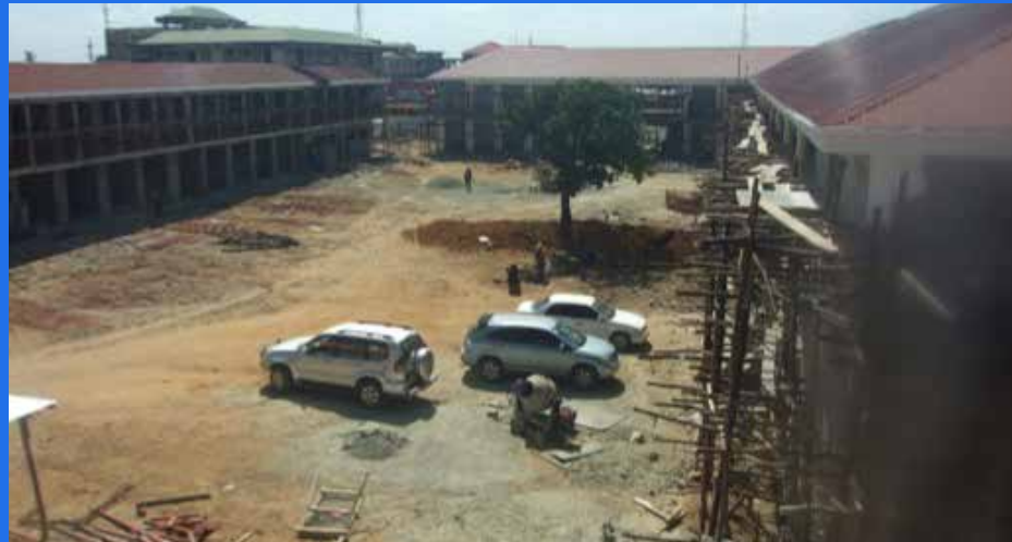
Arua Taxi Park under construction