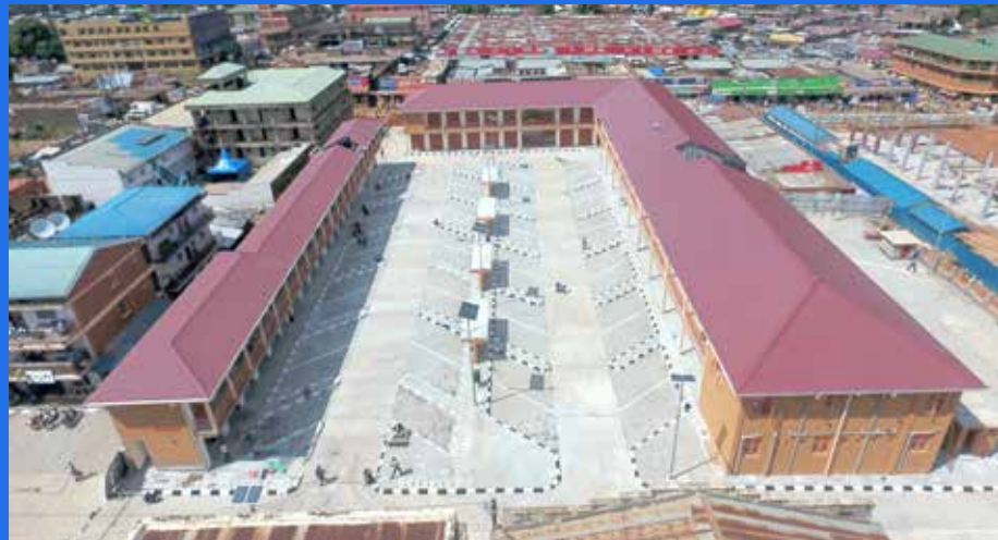
An aerial view of Arua Taxi Park