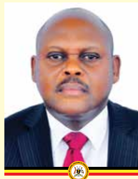
Hon. Isaac Musumba, Minister of State for Urban Development