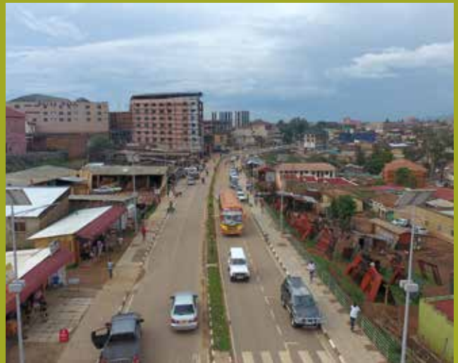
Akiiki Nyabogo Road after redevelopment