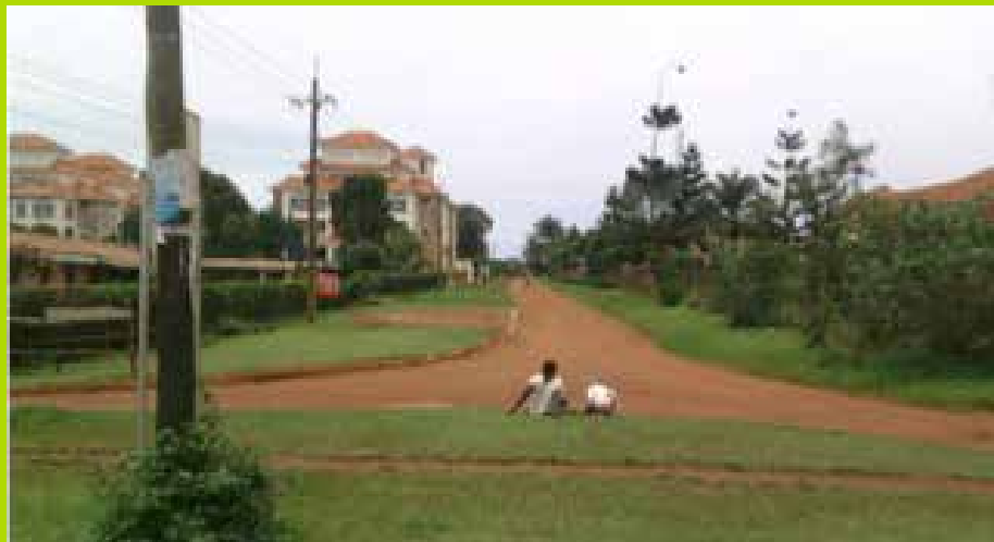
Church Road, Entebbe before redevelopment