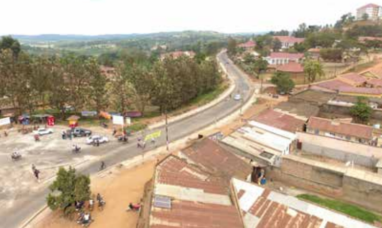
Alex Ssebowa Road

His testimony was echoed by many other traders that were going about their businesses along the busy streets.