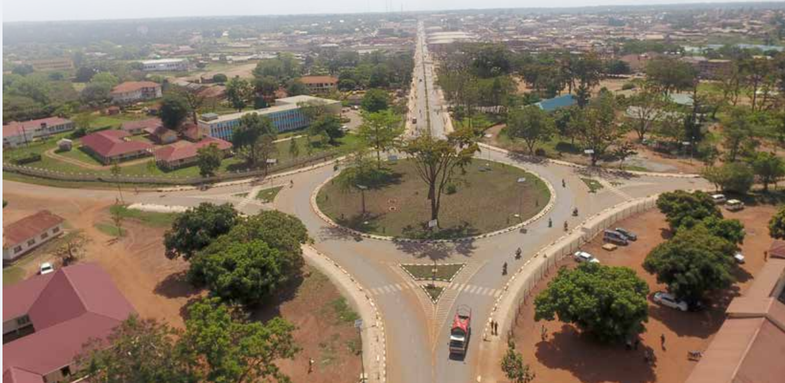
A Roundabout along Obote Avenue

a couple of events and business people are very interested in managing it on our behalf,” he explains. With street lights operational, the town now is open for business for longer hours. Lira managed to extend lights beyond USMID scope due to the interest they earned from the bank. “We earned interest on the money USMID gave us which enabled us to buy 36 lights and work on some roads that were out of USMID program scope,” explains the Town Clerk.