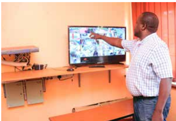
A CCTV system with 32 cameras was installed at Entebbe Municipal Council using funds provided by USMID

Under the USMID program, Entebbe Municipal Council has established a proper records section with two sections which has led to improved record keeping. "We are really happy with this USMID program as it has helped to build the capacity of the staff. We have also installed a security CCTV system with 32 cameras," he added.