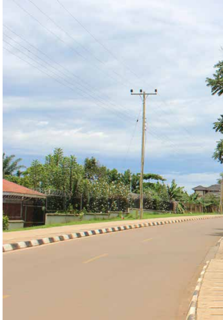
Church Road, Entebbe