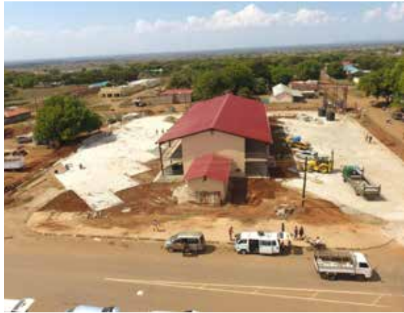
Construction works at the Moroto Bus Terminal