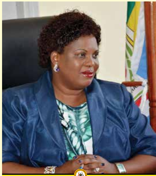
Hon. Amongi Betty Ongom, Minister of Lands, Housing & Urban Development