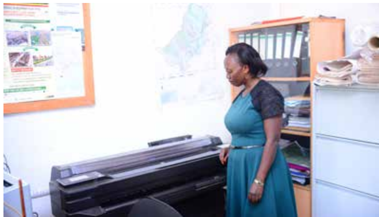
USMID provided a large format printer to the Physical Planning Department