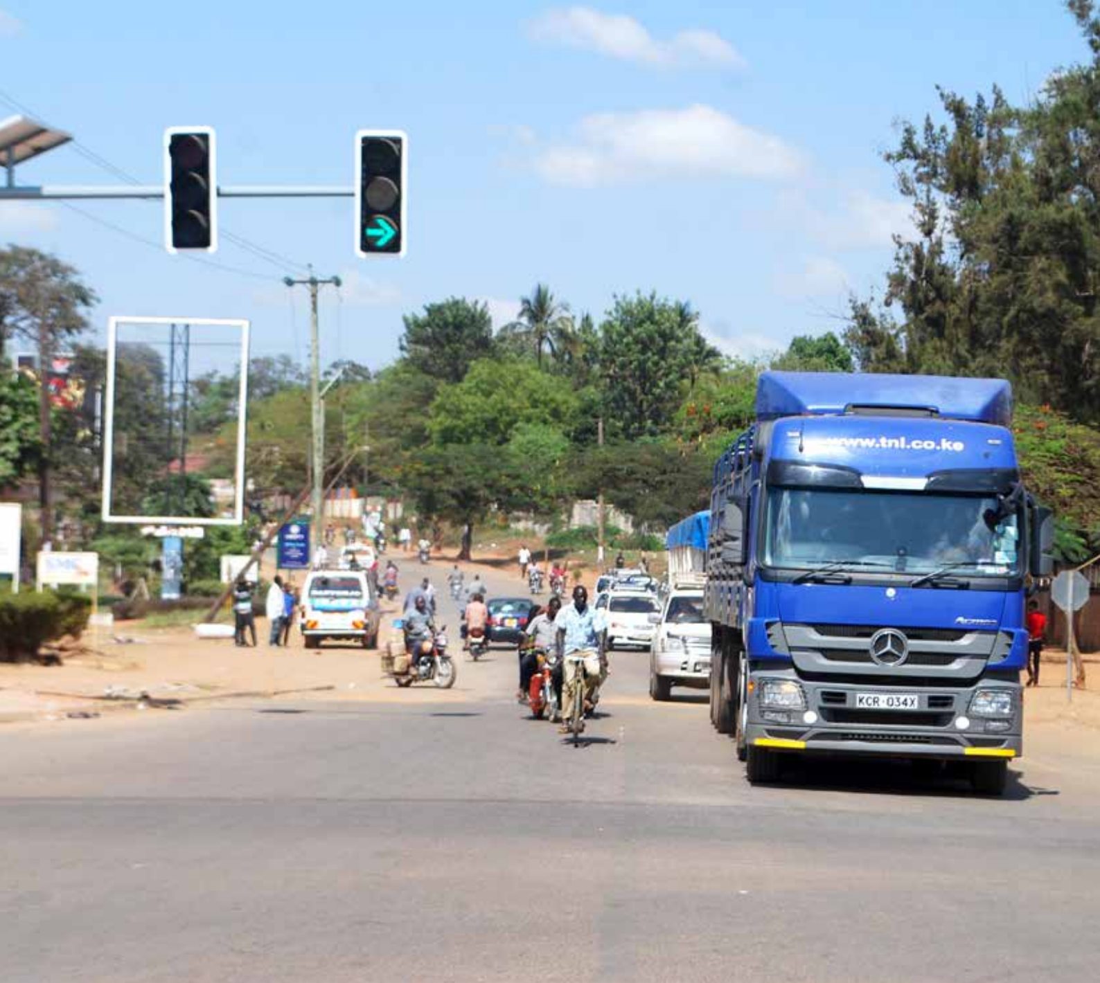
Traffic lights along Pallisa Road in Mbale Municipality