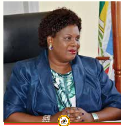
Hon. Amongi Betty Ongom, Minister of Lands, Housing & Urban Development

The implementation of USMID has been a land mark in building the capacity of Municipal Local Governments to develop urban infrastructure that are commensurate with the local priorities. A number of lessons have been drawn to be scaled in the entire country. The lessons range from infrastructure design, development and governance of modern urban authorities as engines of socio-economic transformation.