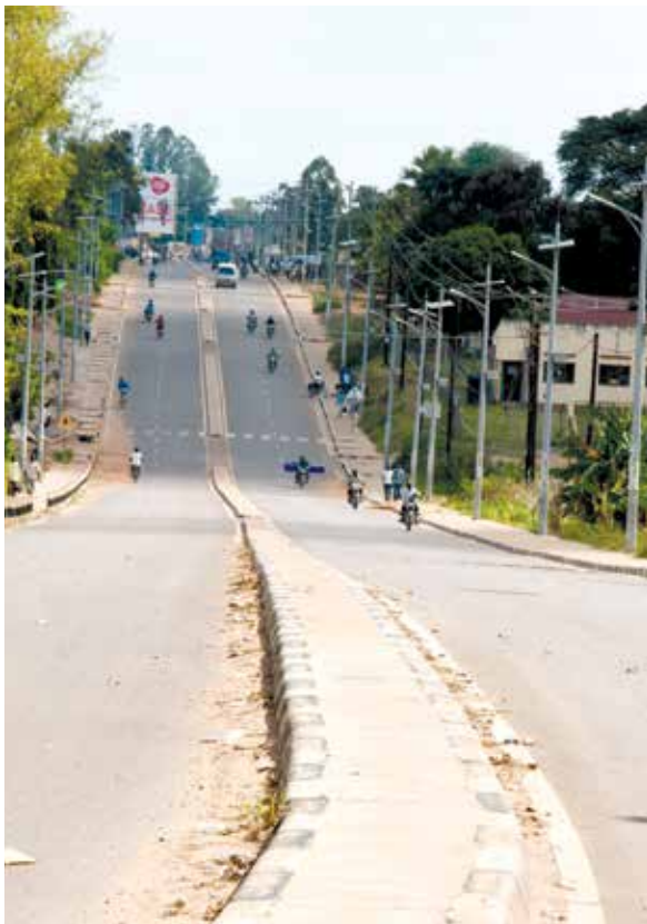
Enyau Road has helped in decongesting the municipality

Arua is the biggest town in West Nile in the north-western part of the country. Under USMID, infrastructure has been improved and the town is well lit. A new taxi park with capacity for 48 taxis has been constructed. It has additional parking capacity of 13 private cars with 119 lock-up shops, one restaurant and one supermarket. Five toilets exist and four shades where people can wait from. The taxi park has a standby 45kva generator. The municipal council's buildings were also improved as well as the capacity building of the staff. The community is excited about the infrastructure. Geoffrey Candia is a shop owner on Idi Amin Road and says that the lighting on the streets has enabled them work long hours and thereby improving their income. "We can now open our shops till very late in the night because of these lights. Our security has improved and people can shop till late," he says.