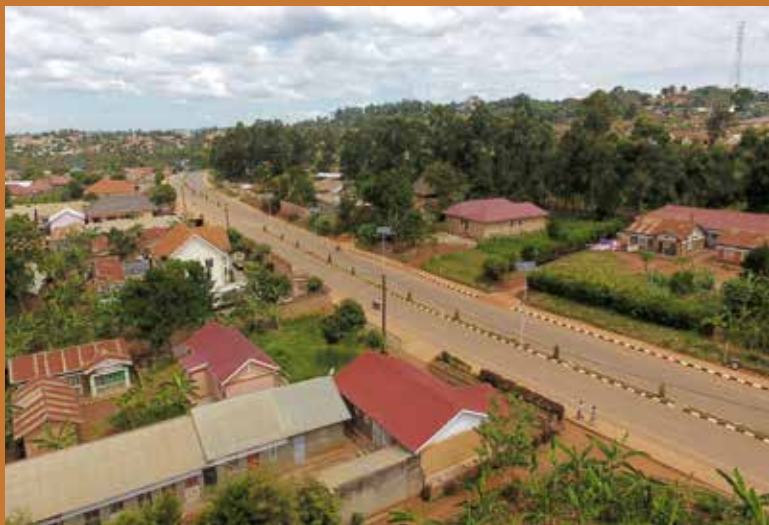
Yellow Knife Road, Masaka before and after redevelopment