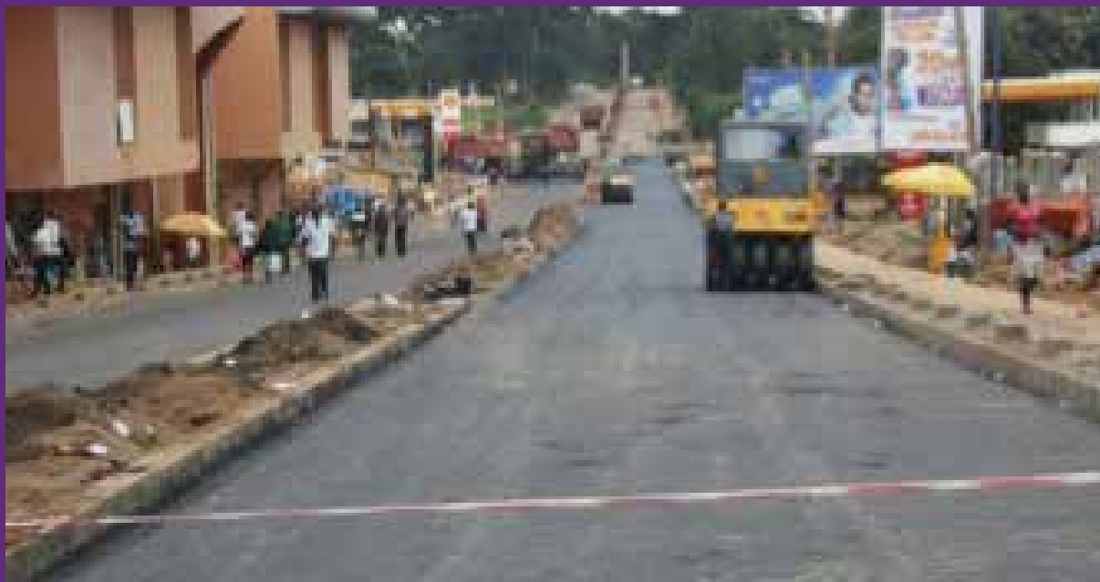
Obote Road under construction