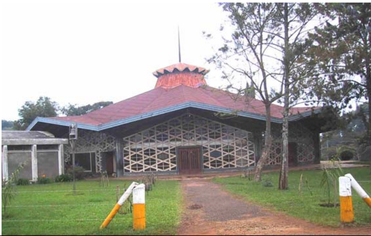
The Catholic Cathedral at Fort Portal rebuilt after the 1966 earthquake to earthquake resistant standards