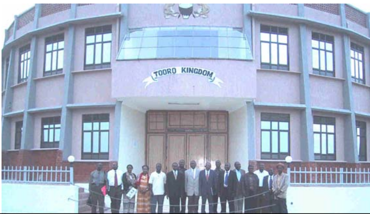
The Kingdom of Toro Palace for H.H. King Rukira Bashaija Oyo Nyimba Kabamba Iguru Rukidi; rebuilt after 1994.