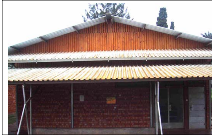
Earthquake resistant building in Virika Hospital, Fort Portal, rebuilt after 1994 earthquake; notice the timber at the gable end of the wall.