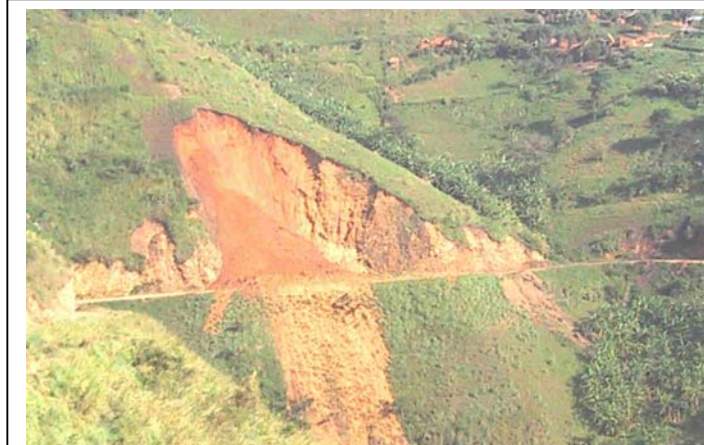
Landslides are very common in the Rwenzori Zone